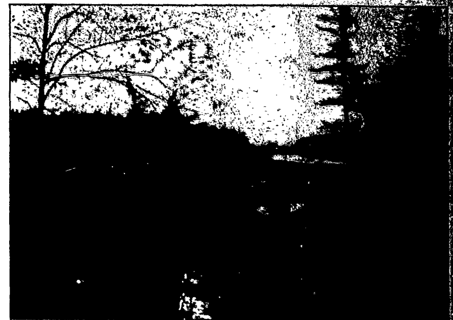
GLIMPSE OF THE ORNAMENT, SENECA PARK

The Presses which printed this Paper are operated by Electricity taken from our mains.