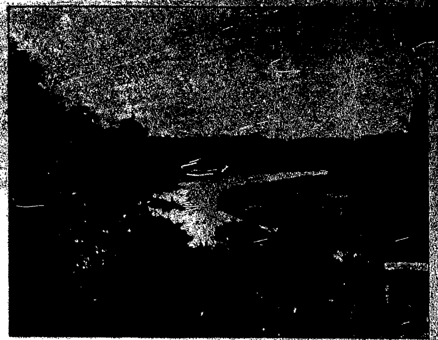
RIVER BEEND, SENECA PARK

A few of the pretty parks reached by the Rochester Railway Company