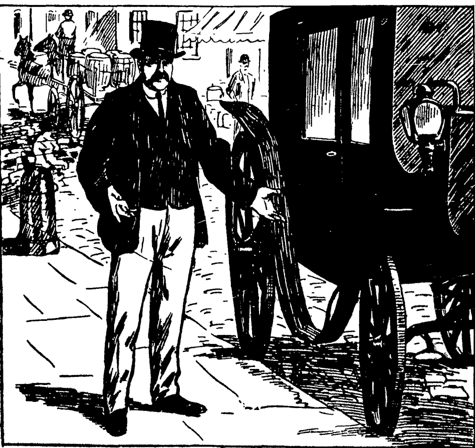
FIND HIDDEN MAN AND WOMAN.