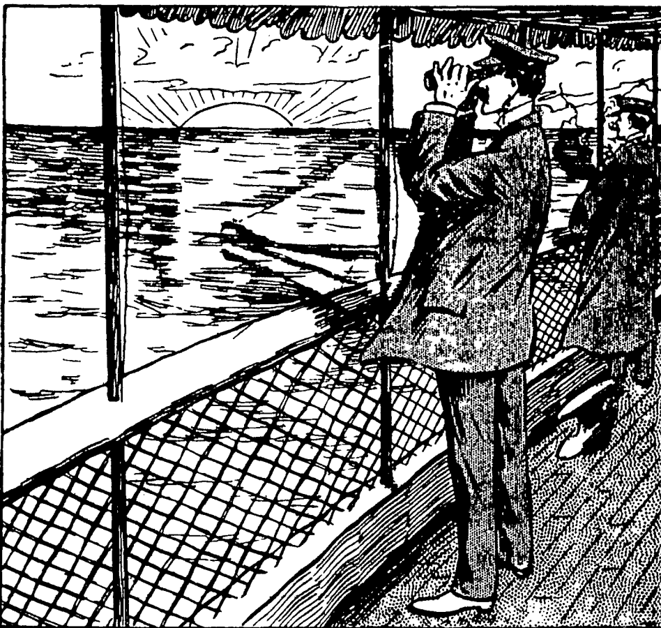
FIND A SAILBOAT AND HIDDEN MAN.