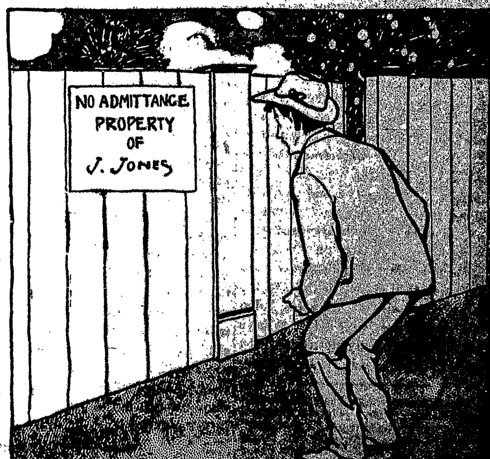
WHAT MILITARY TITLE IS REPRESENTED?