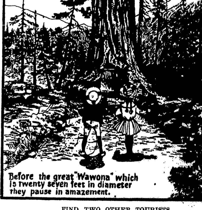
Before the great "Wawona" which is twenty seven feet in diameter they pause in amazement.