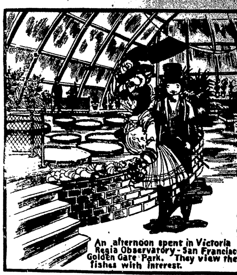
An afternoon spent in Victoria Regia Observatory, San Francisco Golden Gate Park. They view the fishes with interest.