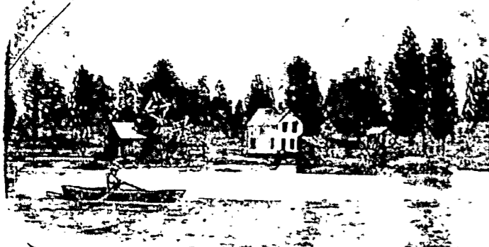
(Medical Lake Wash.)