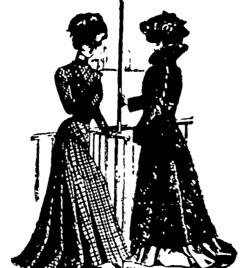
Three Quarter Coat in Mink. Morning or Traveling Costume in Check Pome-pun

We are approaching more artistic ideals in children's clothing. The boy may now dress for all formal occasions in raiment that does not appear to be a reduced replica of that worn by his father. One of those popular forms of dress for the boy is the Eton suit. This is a short jacket made famous by the boys of Eton College, in England. It is what is known in the law as a "monkey jacket." It is precisely like a man's evening coat, except that the tails are cut off. It is worn with a single breasted waistcoat, which buttons rather high. The trousers are long. A wide linen collar is worn outside the coat, and a fluffy black Windsor is the modish tie. The high silk hat of