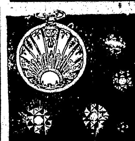
A Woman's Dream.

Is to own bushels of diamonds. And we are making it possible to have that dream a reality. When you realize how cheaply we are selling these handsome diamond rings, you'll want one.