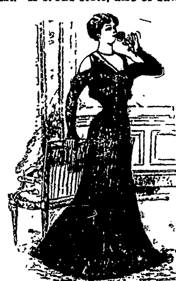
Stylish China Crepe Dress.

Here is an extremely pretty style of dress if carried out according to the sketch, in black China crepe. This material, which is particularly in rawor, lends itself perfectly to the cling- generally not more than an eighth of family census well into the thousands ing form of dress now in fashion and forms soft and graceful pleats. The upper part of the dress is a bolero of black satin, embroidered all over with large black spangles. It is very short and resembles a cuirass encircling the chest. A broad stole, also of satin, em