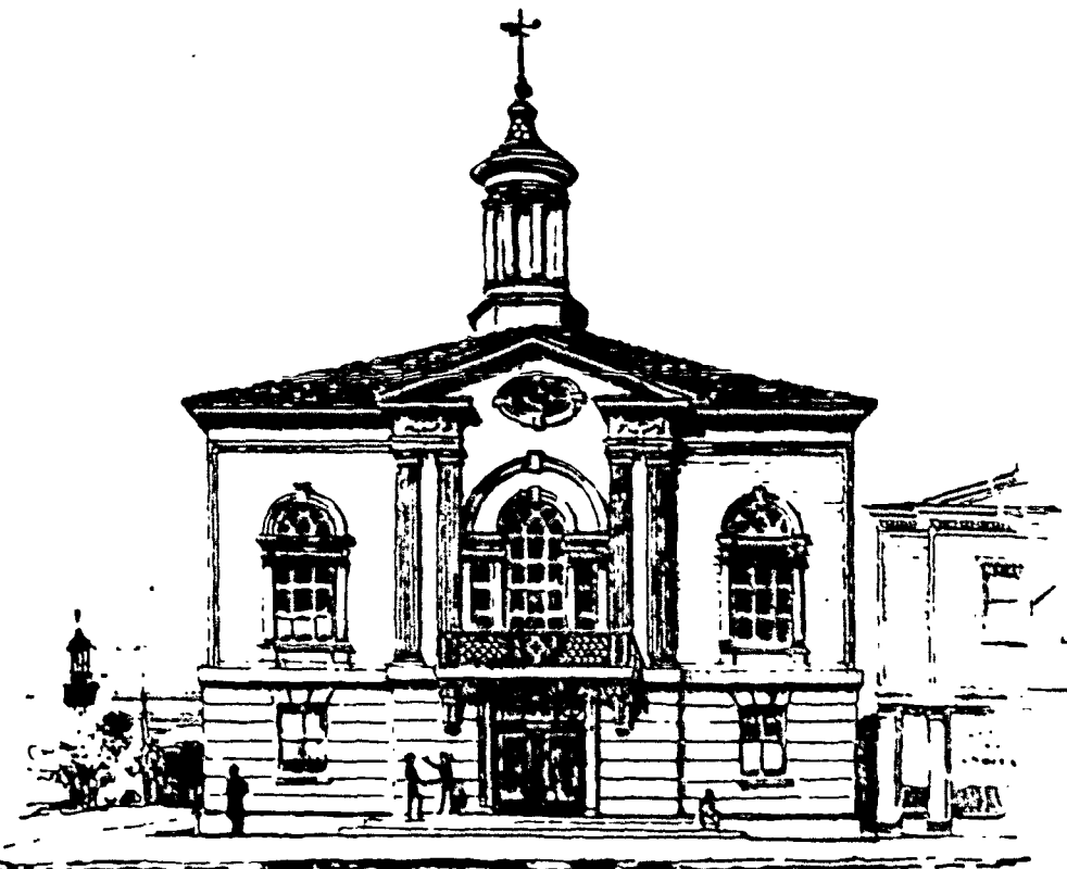
Design for City Hall to be Built at Despatch.

It Is The Wonder of the day! A Grand, Glorious Gigantic Success.