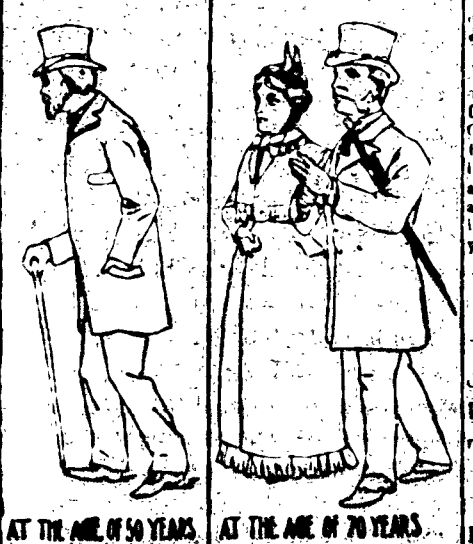
AT THE AGE OF 50 YEARS, AT THE AGE OF 70 YEARS.

Here's a bustle and an exhausted and weary look about the old grandma. He is now on his way to a place of amusement with his wife. He is not fatigued with his day's work, but is full of life and enjoys himself. There is nothing that makes a man of woman feel as young as these tablets. Take them and be young and happy again.