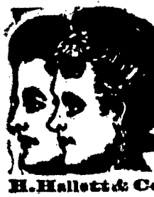
H. Hallett & Co., Box 660 Portland, Maine